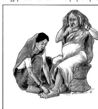
Fig. 3b: Swelling of legs, severe headache, blurrin shows a woman bleeding. Another card shows a woman with very swollen legs.

The cards are used during talks with pregnant women to explain when women