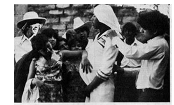
This group is performing a skit To add humor and to make people stop and think, a man is pretending to be a pregnant woman.