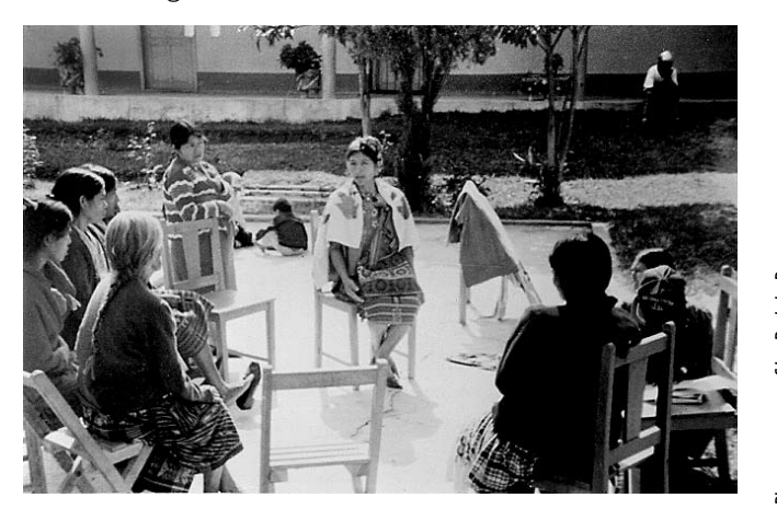
Mayan midwives at a health training

For many Mayan communities in Chiapas, Mexico, the word midwife has come to mean many things: health worker, teacher and organizer, as well as a person who puts the needs of women first. Some of the Mayans fled from Guatemala to Mexico to escape the government's brutal violence against native people. Isolated from their original communities, many now live in Mexican villages hours away from the nearest hospital. To make childbirth safer for these women, midwives have decided that they need to work together, share their knowledge and strengthen their training.